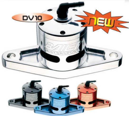
Subaru Impreza Version 5/6 Turbo (incl. WRX/STI) 1999-'2001 Only