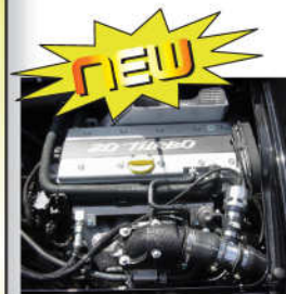
Vauxhall VX220 Turbo with DV26 valve fitted