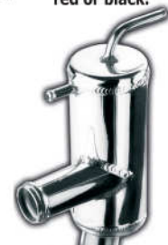
SP21 Focus 1.8/2.0 (NOT RS)