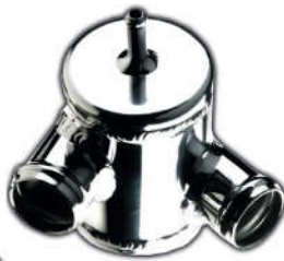
SP18 Escort RS Turbo S1/S2