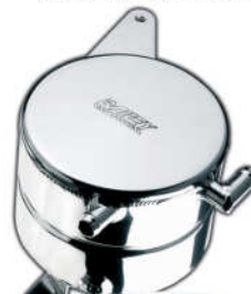
OST20 Vauxhall Nova 16v