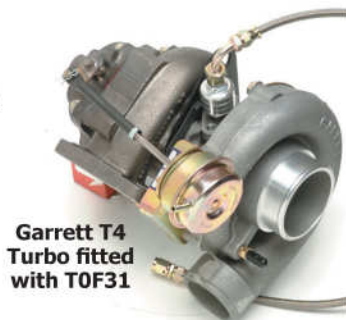
Garrett T4 Turbo fitted with TOF31

TURBO OIL FILTER 1/8" BSP Male to Female (direct to turbo only)