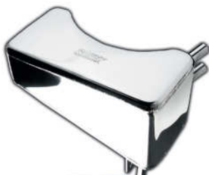
OST16/1 Escort/Sierra Cosworth 'Mirror Image'