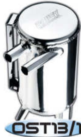
OST13/1 Sierra Cosworth 2wd/4wd