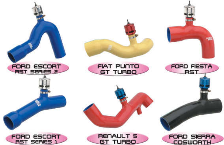
FORD ESCORT RST SERIES 2