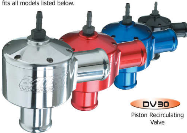
DV30 Piston Recirculating Valve

All the benefits of our piston design, but with less audible 'whoosh'. The DV30 was originally designed as a direct replacement for the factory fitted Bosch dump valve found on a wide variety of cars. The Bosch valve is made of plastic, contains a rubber diaphragm and is known to fail when subjected to too much boost pressure or excessive temperatures. The DV30 is the perfect choice for a standard car or fire-breathing 550+ BHP tuned vehicle, capable of withstanding huge amounts of boost with its high temperature piston internals and CNC machined body. As the DV30 is designed to direct the dumped boost back into the air filter or airstream, it is generally speaking 'silent' in operation and can alleviate any annoying 'fluttering' noises in many 'Bosch' equipped applications. It is also possible to retro-fit the DV30 onto a wide variety of cars, please call for details. Considered an essential upgrade for any vehicle with the VW/Audi 20v 1.8 turbo engine and fits all models listed below.