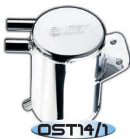
OST14/1 Escort Cosworth