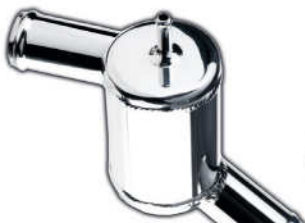
SP17/1 Sierra Cosworth 2wd/4wd

All swirl pots are supplied with a fitting kit (shown) including hose clips and Samco silicone hose in either blue, red or black.