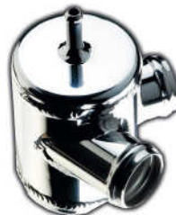
SP19 Fiesta RS Turbo