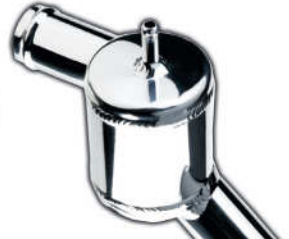
SP20 Escort Cosworth