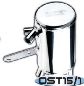
OST15/1 Escort RS Turbo S1 & S2