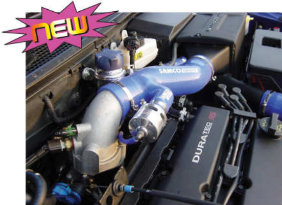
Focus RS with dump valve pipe and DV26 valve