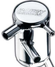
OST17/1 Fiesta RS Turbo